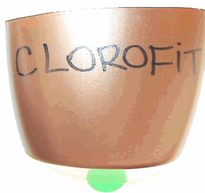
View of content (1mm x 1mm scale)