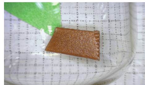
17.3mg analyzed (1mm x 1mm scale)

Required Disclosures: All work was done at Beta Analytic in its own chemistry lab and AMS. No subcontractors were used. Beta's chemistry laboratory and AMS do not react or measure artificial C14 used in biomedical and environmental AMS studies. Beta is a C14 tracer-free facility. Validating quality assurance is verified with a Quality Assurance report posted separately to the web library containing the PDF downloadable copy of this report.